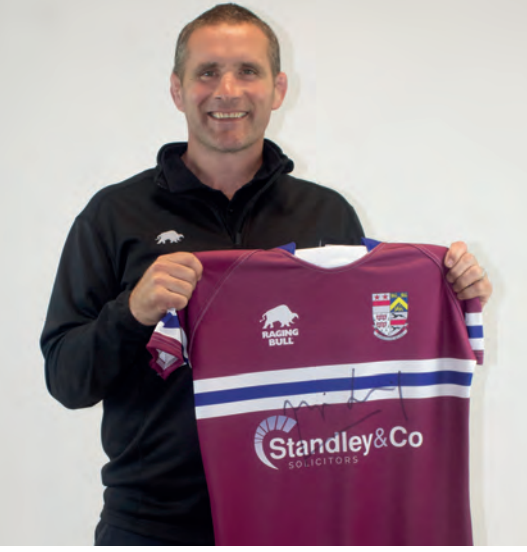
If your club, team, school are looking for a new kit supplier or a new kit partnerships, please do not hesitate to contact your local sales manager, or the head office. (CLICK HERE FOR INFO!)